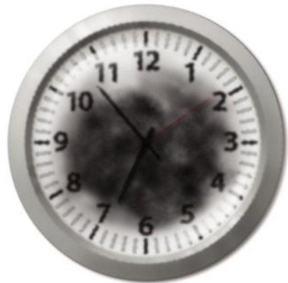
With AMD, dark areas may appear in your central vision.

Wet AMD: This form is less common but much more serious. Wet AMD is when new, abnormal blood vessels grow under the retina. These vessels may leak blood or other fluids, causing scarring of the macula. You lose vision faster with wet AMD than with dry AMD.