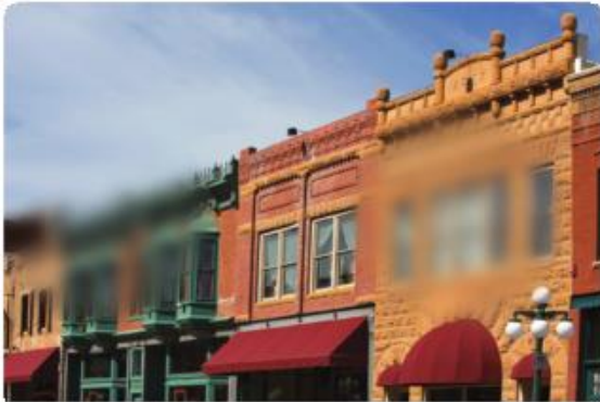
A normal visual field is represented in the top image on the top. The bottom image is an example of early to moderate visual field damage.