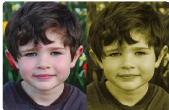
Left, normal vision. At right, dull or yellow vision.